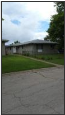
4 unit Carstare 2